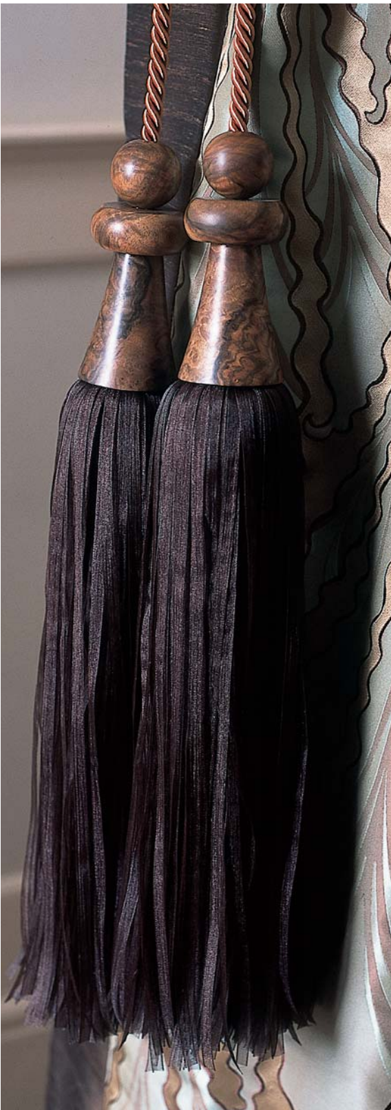
Left: Iroko and organza ribbon tie-back. The natural beauty of iroko wood is the main feature of this richly dark piece. Highlighted by a satin varnish and its complementary deep chocolate organza ribbon fringe, this long tie-back is a chicly elegant addition to any room setting.