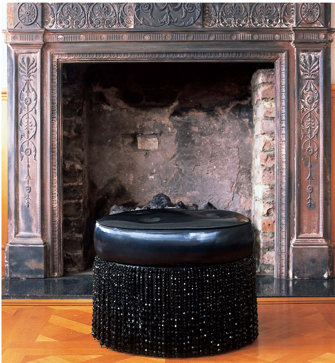
Above: Jet crystal footstool.

This romantically dark footstool comes alive with its deep gleaming fringe created by its lead-crystal beads in faceted jet pieces. Its unusual black duchesse-satin cushion is deep-buttoned and chicly crowns the wonderful fringe. Pieces by commission come in a wide range of colours and sizes and can incorporate the client's own fabric.