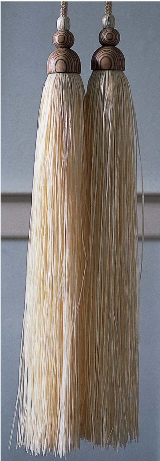
Right: Raffia and birch (outdoor) tie-back. With the modern shapes created by the natural plywood birch bobbles, this long raffia fringed tie-back is a beautiful piece suited to even the outdoor marquee or patio area. Uniquely modern in concept, the unusual medley of materials really inspires additional uses for these long and striking double tassels.