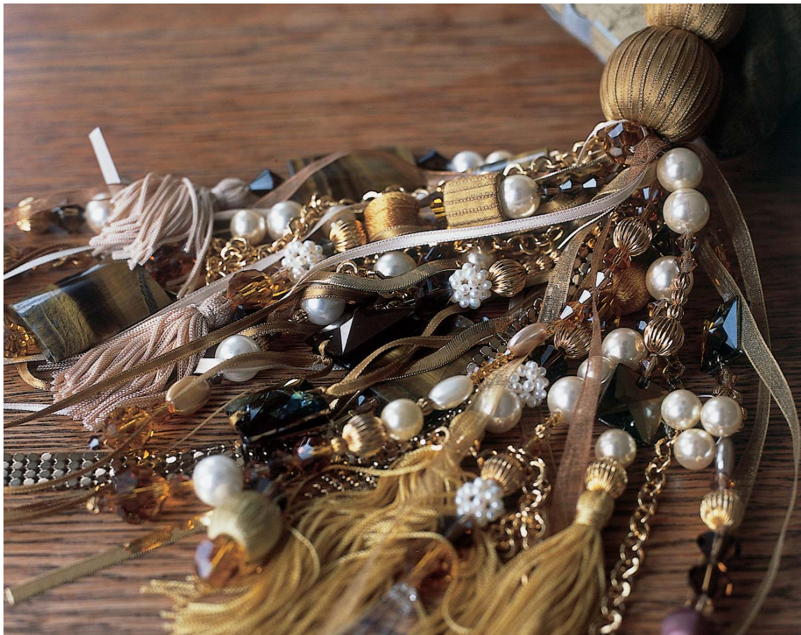
Above: Charm tassel.

A veritable medley of soft and hard materials creates this uniquely exuberant piece, playfully interpreting the latest fashion trends with jewellery chain sitting daringly alongside pearlescent charms, with soft tassels nestling amidst crystal pearls and golden ornaments. Chain-mail wraps itself teasingly around French double satin ribbon and organza, this playful piece is a 'must-have' for the chicly fashion conscious.