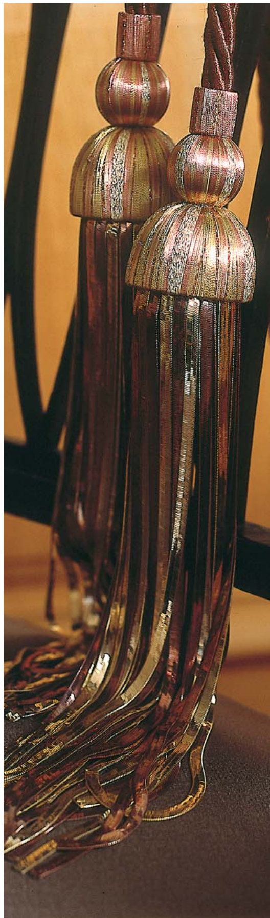
Right: Contemporary cobra chain. Fabulously sleek, this tie-back just seems to melt away with its delicate lustre, of pink and yellow gold finishes. The bobbles are hand-covered in metalised threads to further accentuate this ultimately contemporary look.