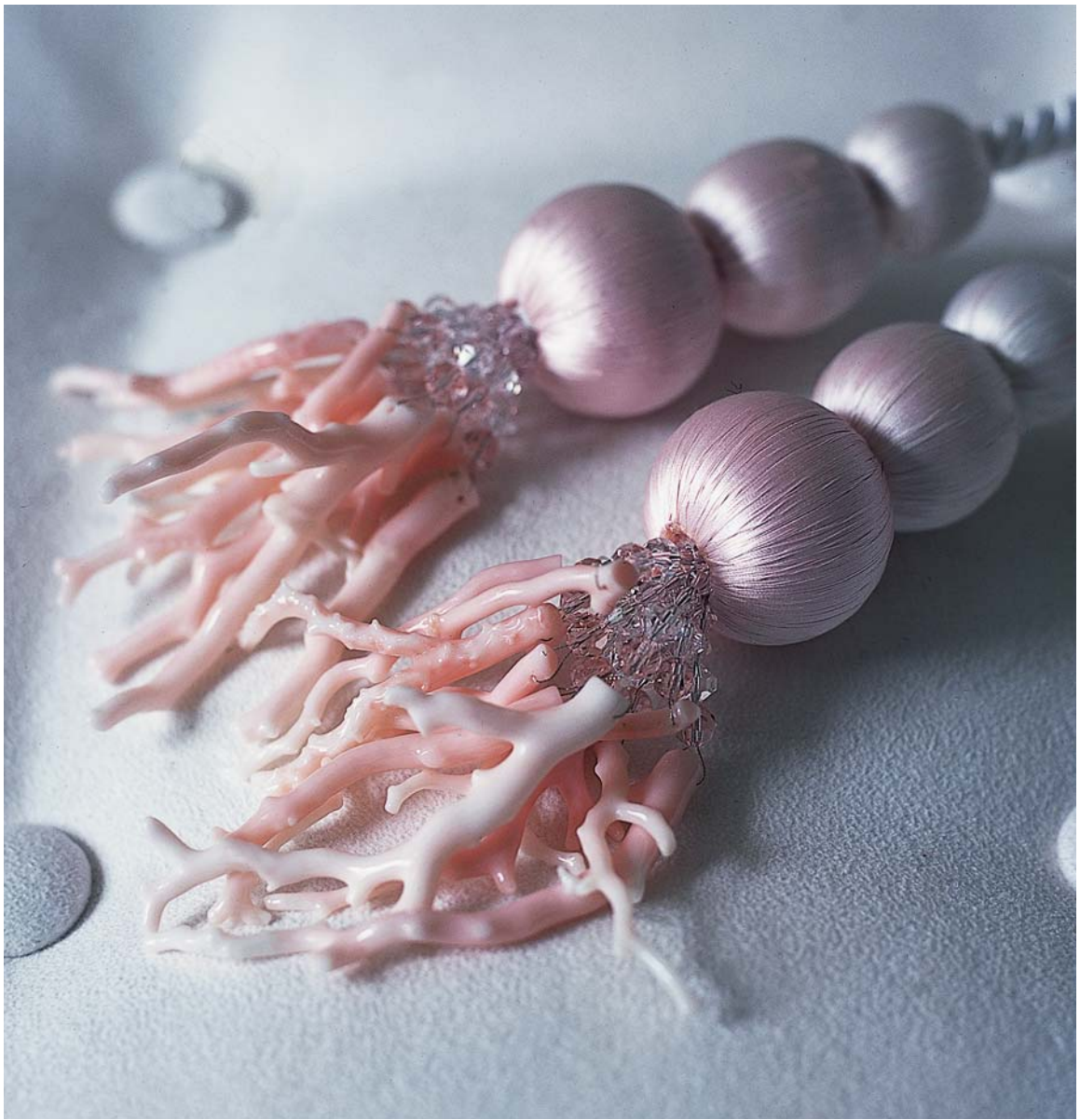
Pink coral tie-back.