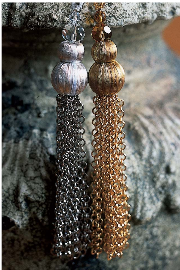
Left: Chain key tassels.

A veritable medley of soft and hard materials creates this uniquely exuberant piece, playfully interpreting the latest fashion trends with jewellery chain sitting daringly alongside pearlescent charms, with soft tassels nestling amidst crystal pearls and golden ornaments. Chain-mail wraps itself teasingly around French double satin ribbon and organza, this playful piece is a 'must-have' for the chicly fashion conscious.